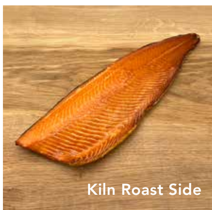
Kiln Roast Side