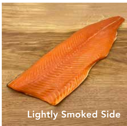
Lightly Smoked Side