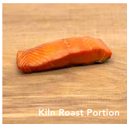
Kiln Roast Portion

By using a different brining technique this salmon is ideal for poaching and delivers a truly excellent and consistent product. Perfect for home cooks to the banqueting table.